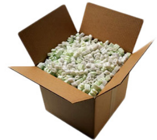
AFA packs with great care to ensure no product damage upon delivery