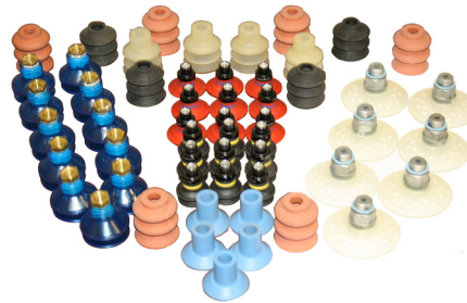
AFA offers a wide selection of suction cups in stock for quick delivery