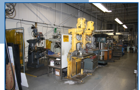
AFA has full machine shops available at their facilities. This allows AFA to quickly turn over custom machined parts for your equipment.