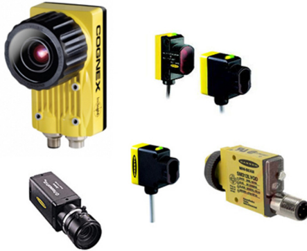
A wide array of electrical components are in stock and available at OEM prices