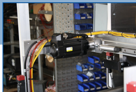
A wide variety of servo motors are in stock at AFA ready for fast deliver. Also, one of our expert technicians can install the servo motor to reduce machinery downtime.