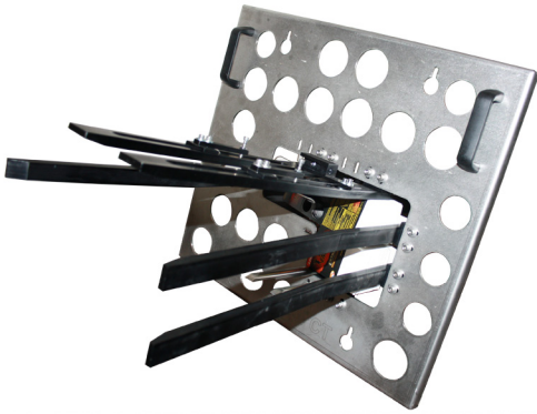
AFA can pre-assemble components for added customer convenience and to lower costs