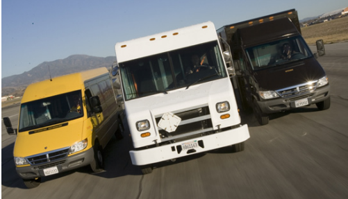
AFA offers expedited shipping for service parts with different couriers such as UPS and FedEx