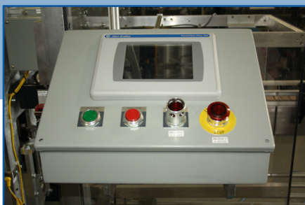
New Allen Bradley Panelview screens can be programmed at AFA before shipment to save both time and money.