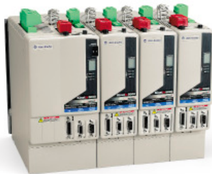
Allen-Bradley Kinetix® 6000 Servo Drive