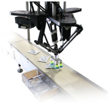
MK-DLT Delta 3 Robot