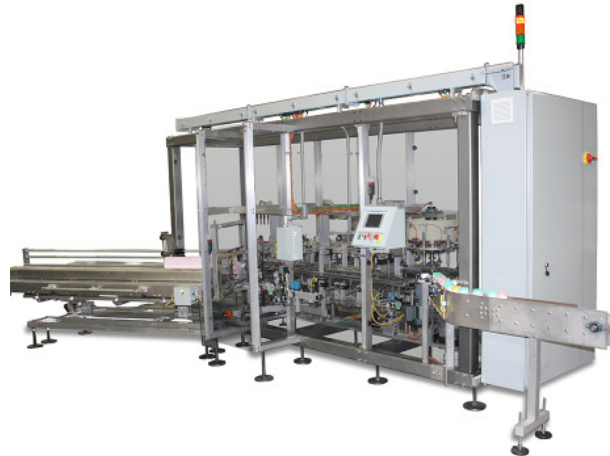
VC-VCA Vertical Autoload Cartoner from AFA Systems

AFA Systems Inc. takes pride in creating efficient and innovative automated packaging systems for manufacturers around the world. Based in Toronto, Ontario, the company manufactures a complete line of horizontal and vertical cartoners, carton and case formers, top- and end-load case packers, robotic systems and more.