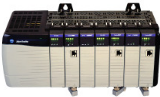
Allen-Bradley® ControlLogix™ Programmable Automation Controller