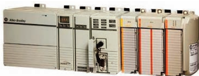
Allen-Bradley® CompactLogix™ Programmable Automation Controller