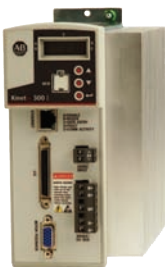
Allen-Bradley Kinetix® 300 Indexing Servo Drive