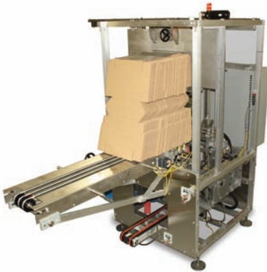
DSSC Case Former from AFA Systems