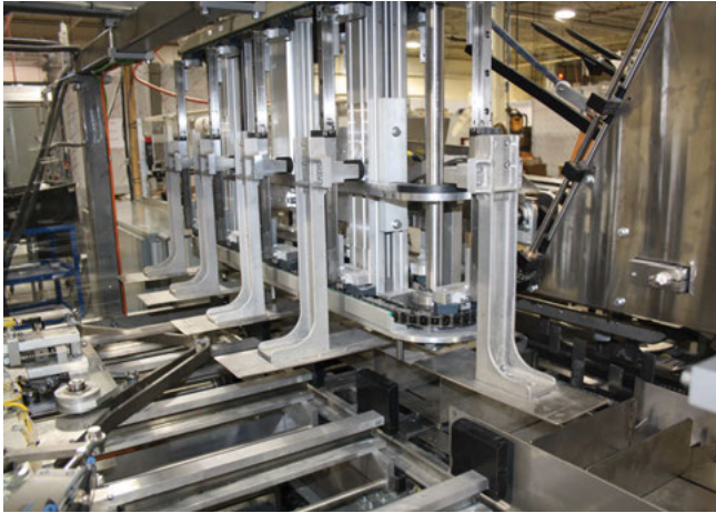
The cartoner's overhead barrel cam loader and sliding style buckets help ensure positive loading.

"Machine flexibility was the most challenging aspect of the project," explained Eric Langen, sales and marketing representative, AFA Systems. "We had to build a solution that could handle multiple packaging parameters and materials."