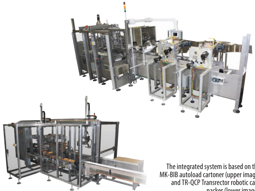
The integrated system is based on the MK-BIB autoloader cartoner (upper image) and TR-QCP Transrector robotic case packer (lower image).

When a leading manufacturer of powdered baby formula required secondary packaging equipment for their Jakarta, Indonesia facility, they turned to an innovative supplier half a world away. Ontario-based AFA Systems provides custom engineered and fully integrated end-of-line packaging solutions to meet exacting – and oftentimes unique – specifications.