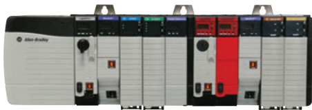
Allen-Bradley CompactLogix Programmable Automation Controller