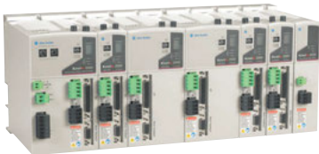
Allen-Bradley Kinetix 2000 Multi-Axis Servo Drive