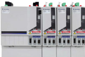
Allen-Bradley Kinetix 6000 Multi-Axis Servo Drive